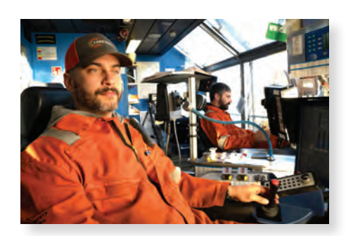
Drilling crew in cyber chairs testing drilling equipment for upcoming campaign in the North Sea.